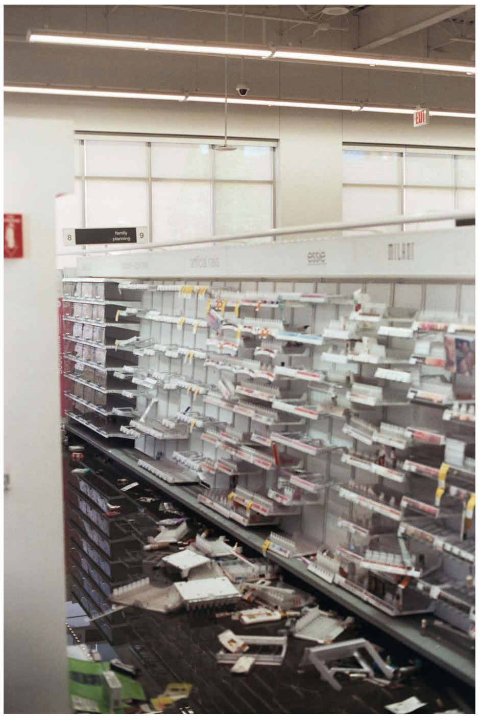
May 29: The beauty supply section of a looted Walgreens on Lake Street, just east of the Third Precinct.

The intelligence of the crowd proved itself as participants quickly learned five lessons in the course of this struggle.