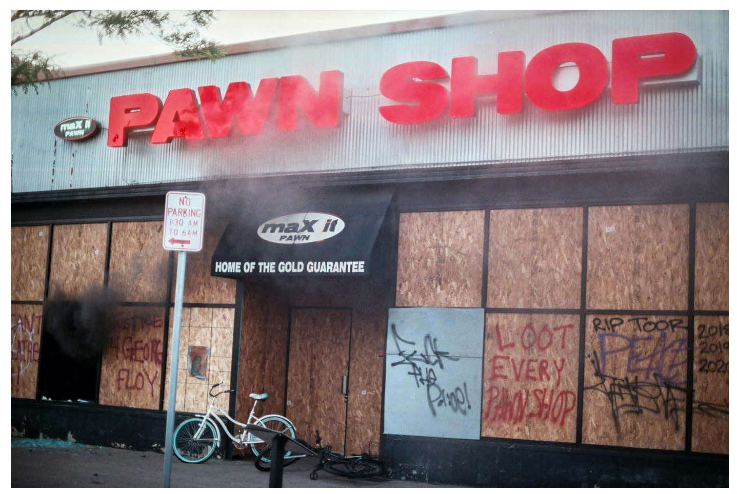
May 28: A looted pawn shop east of the Third Precinct on Lake Street about to catch fire. The story spread that the previous night, the owner had shot and killed someone.