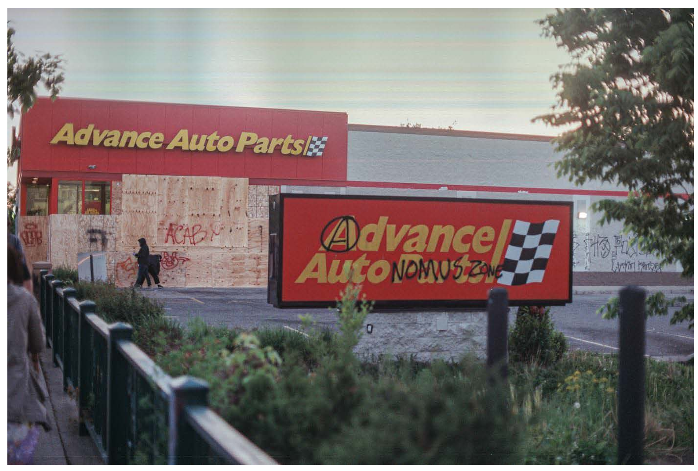
May 29: Graffiti from the previous night adorns businesses.