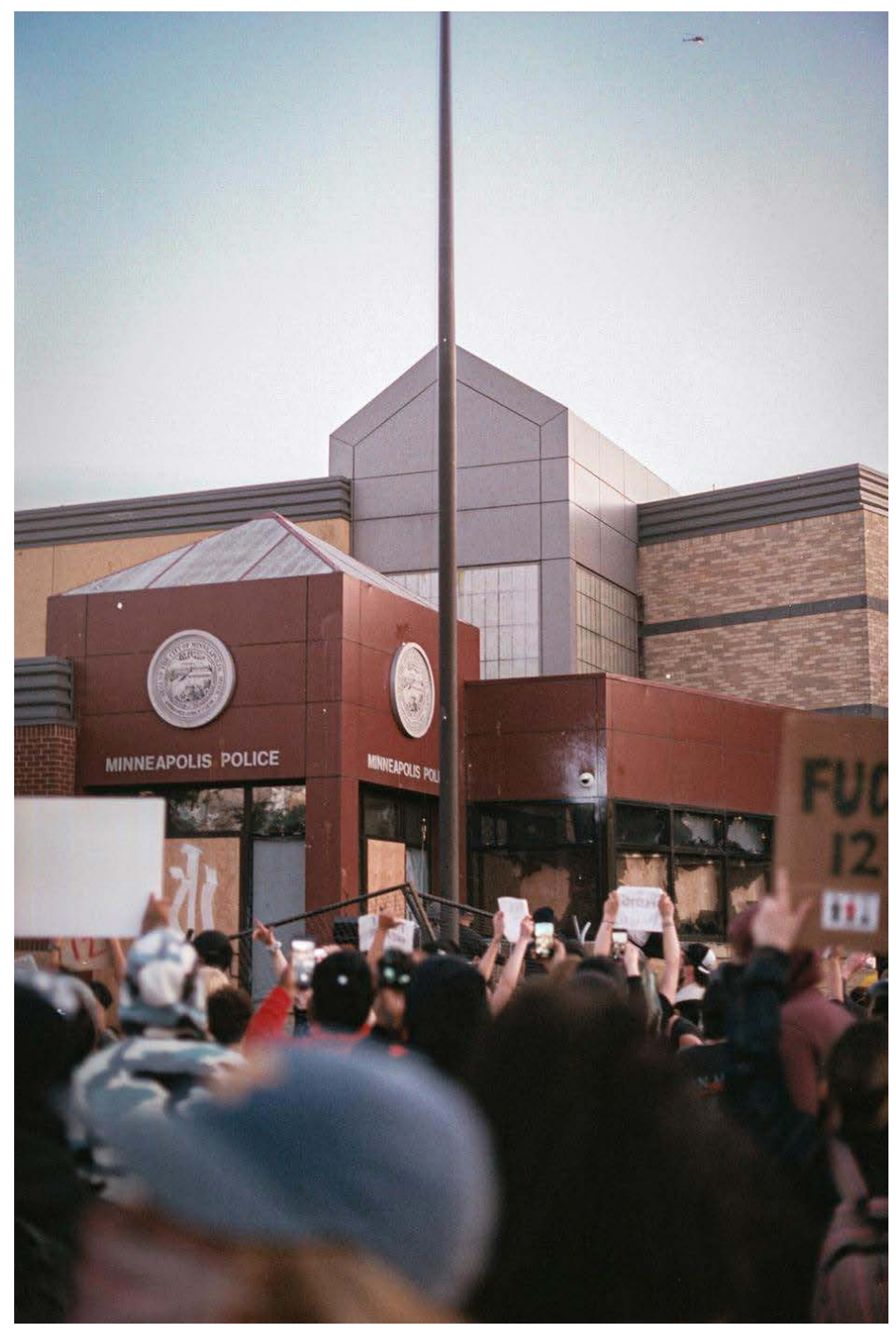
May 28: The Third Precinct during the day. It was set alight that night.