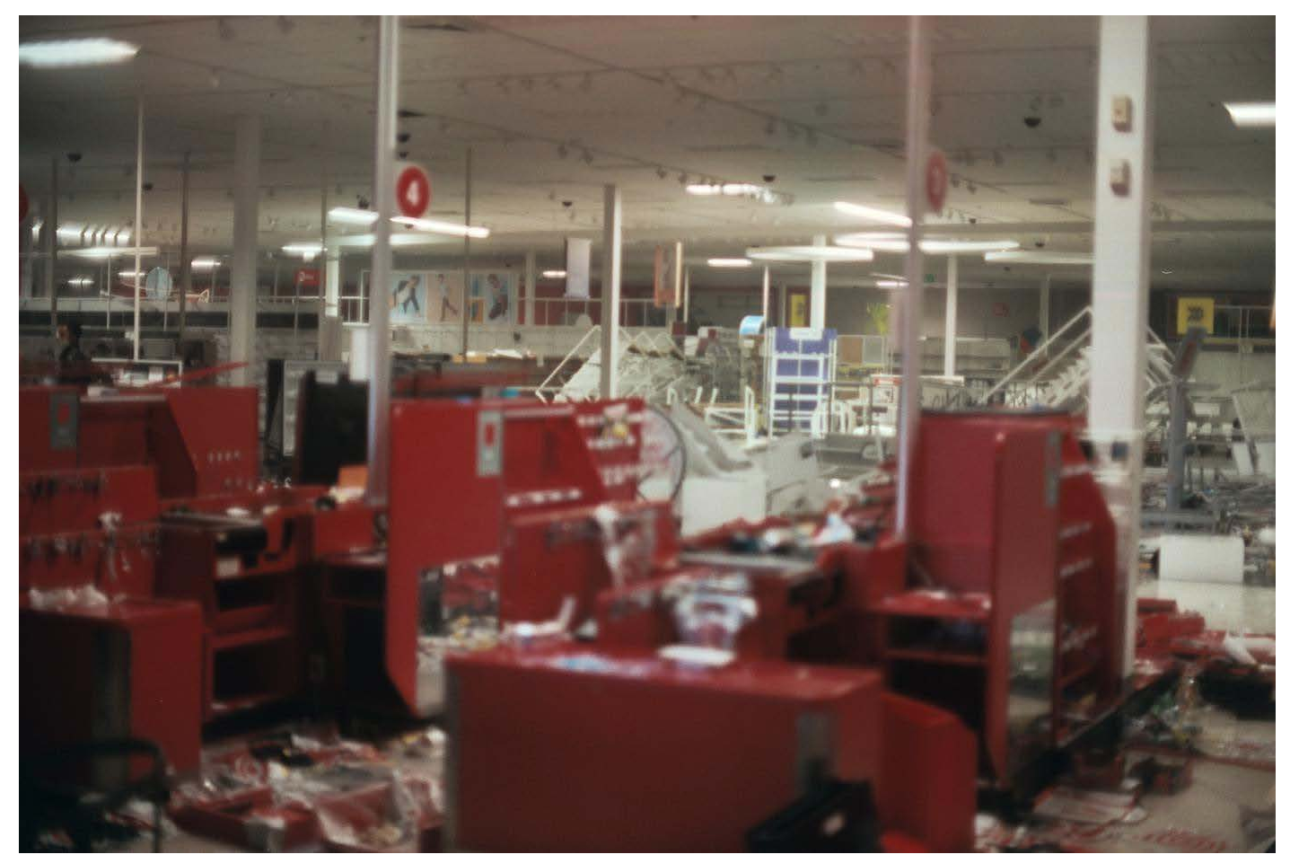
May 28: Inside the liberated and gutted Target across Lake Street from the Third Precinct.