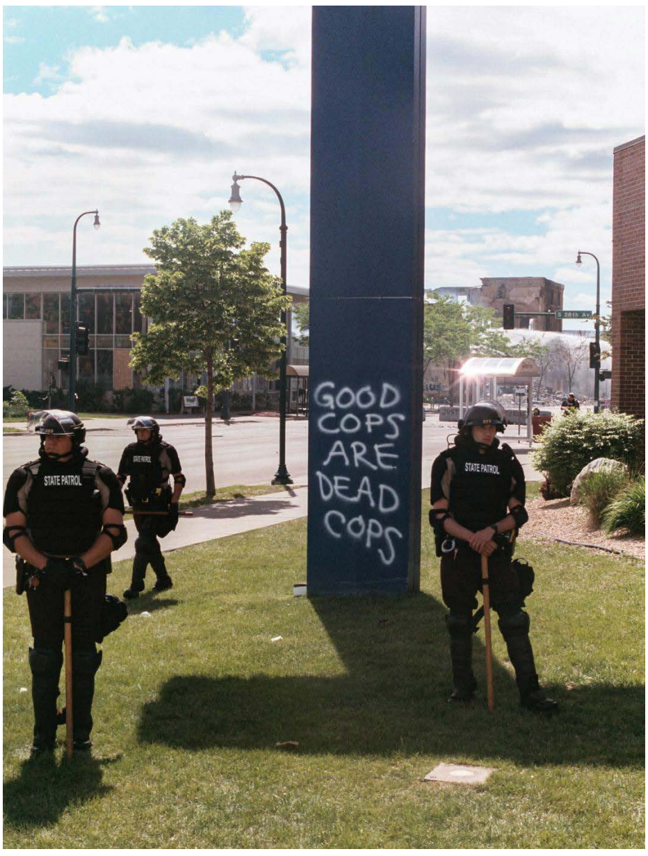
May 29: Police forming a perimeter around the Third Precinct a few hours before curfew.