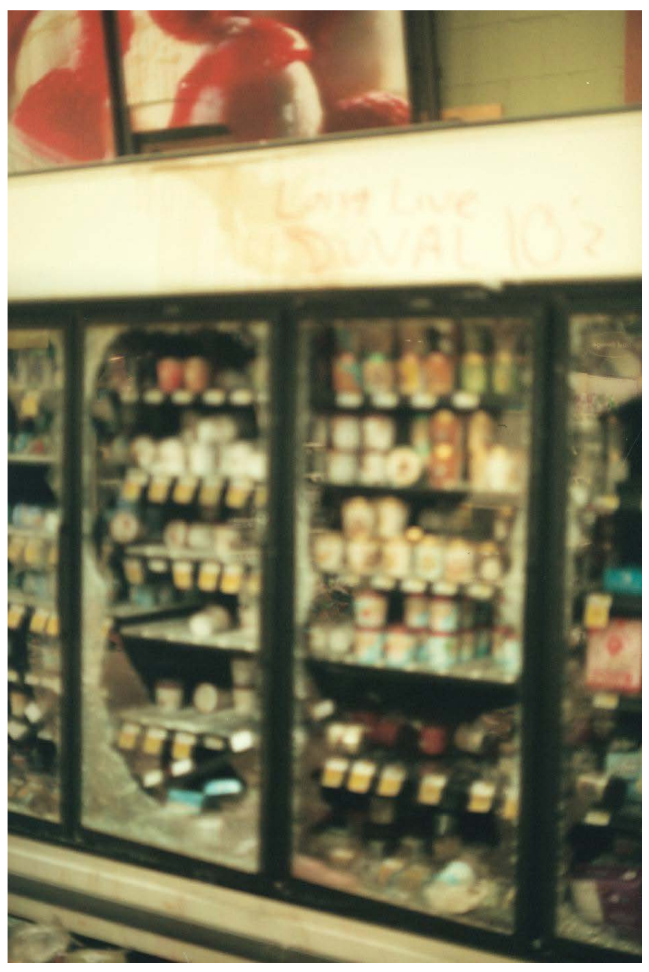
May 28: The interior of Cub Foods, next to the Target that was looted. A large quantity of melted ice cream.

soundscape and "rev up" the crowd. This began with a pick-up truck with a modified exhaust system, which was parked behind the crowd facing away from it. When tensions ran high with the police and it appeared that the conflict would resume, the driver would red line his engine and make it roar thunderously over the crowd. Other similarly modified cars joined in, as well as a few motorcyclists.